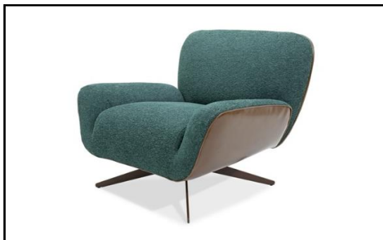
cod. 100 ARMCHAIR